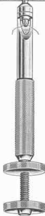
LOUTE 33.531.21 21 cm