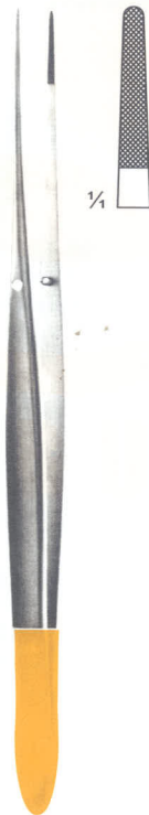
CUSHING 05-451-180 18 cm