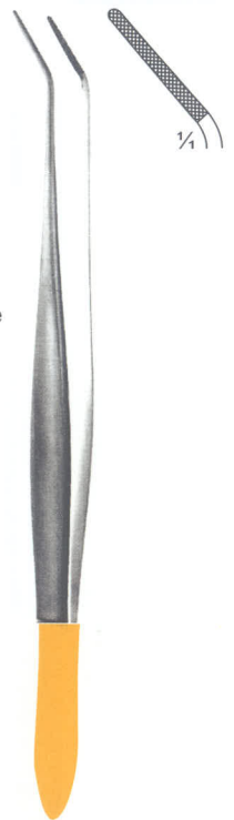
CUSHING 05-455-180 18 cm

05-454-180 18 cm Tissue w/Pin, 1:2 Teeth