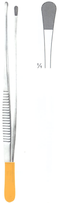
WANGENSTEEN 05-437-150 15 cm 05-438-230 23 cm 05-439-250 25 cm