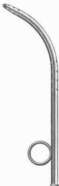
mm WAGENER-MOSHER 5 54.151.05 7 54.151.07 9 54.151.09