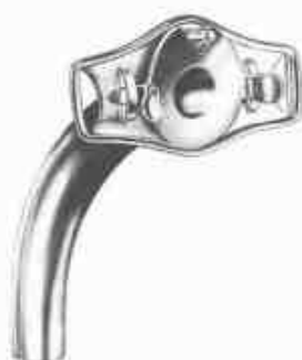
Fig. mm LUER 0 4 54.220.04 1 5 54.220.05 2 6 54.220.06 3 7 54.220.07 4 8 54.220.08 5 9 54.220.09 6 10 54.220.10 7 11 54.220.11 8 12 54.220.12 9 13 54.220.13