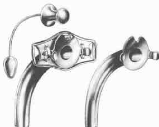
Fig. mm JACKSON 0 4 54.240.04 1 5 54.240.05 2 6 54.240.06 3 7 54.240.07 4 8 54.240.08 5 9 54.240.09 6 10 54.240.10 7 11 54.240.11 8 12 54.240.12 9 13 54.240.13