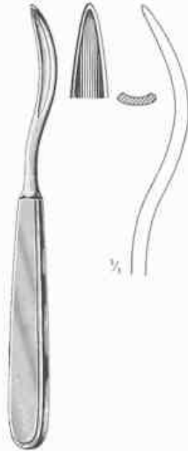
SCHMIEDEN 26.271.19 19 cm