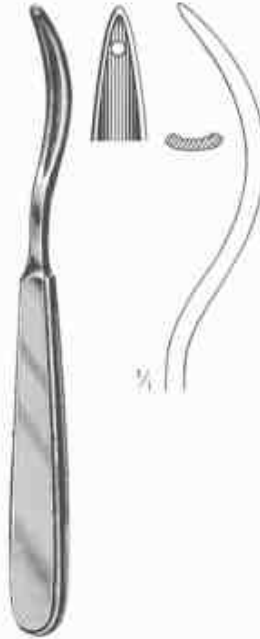
SCHMIEDEN-PAYR 26.273.19 19 cm