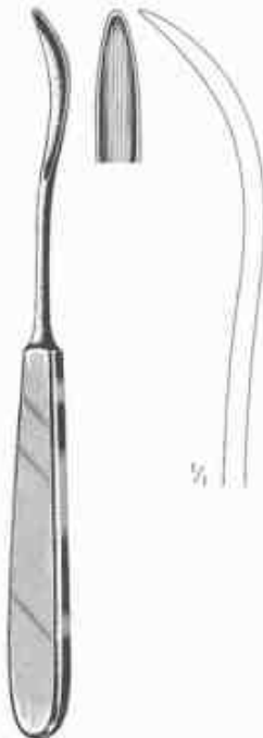
KOENIG 26.285.20 20 cm