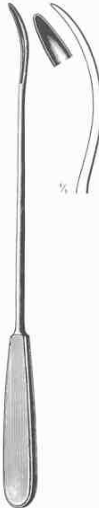
BRUNNER 26.275.30 30 cm