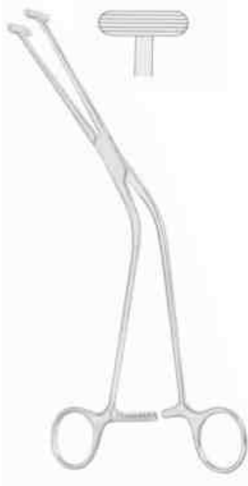
MILLIN 66.111.23 24,5 cm