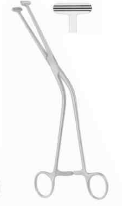
MILLIN 66.117.23 22 cm