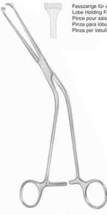
MILLIN 66.123.23 22 cm

Fasszange für vordere Lappen Lobe Holding Forceps Pince pour saisir les lobes Pinza para lóbulos anteriores Pinza per lóbuli anteriori