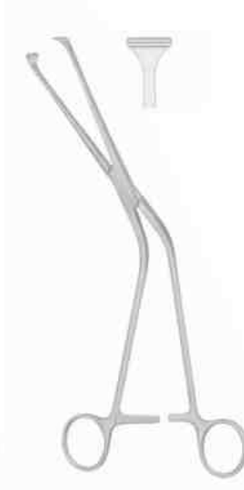
MILLIN 66.115.24 24,5 cm