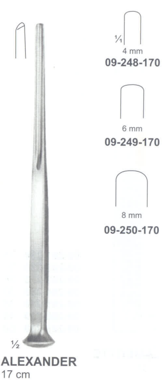
ALEXANDER 17 cm