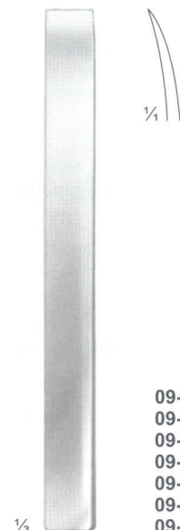
LAMBOTTE 23 cm